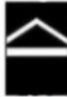
CADET PRIVATE FIRST CLASS