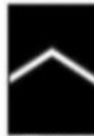
CADET PRIVATE SECOND CLASS