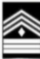
CADET FIRST SERGEANT