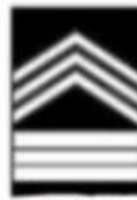
CADET MASTER SERGEANT