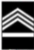
CADET STAFF SERGEANT