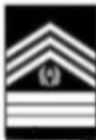
CADET COMMAND SERGEANT MAJOR