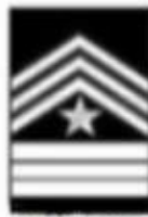
CADET SERGEANT MAJOR