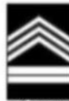
CADET SERGEANT FIRST CLASS